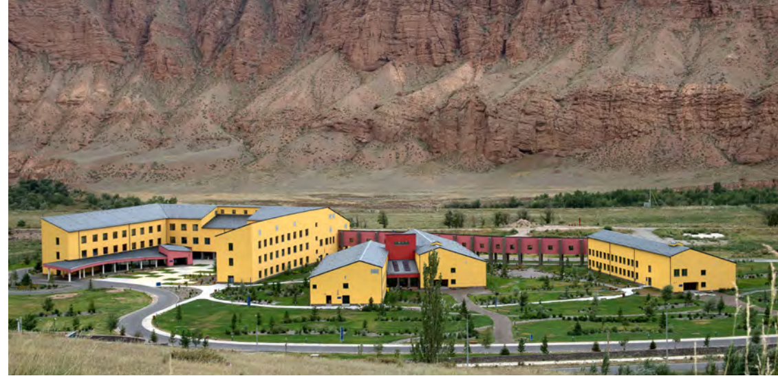
The University of Central Asia (UCA), Naryn Campus