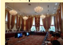
In the conference

Human Resources - the Basis of Country Development