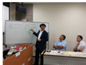
During the lecture

The training will provide participants with an understanding of the situation with BA of Japan, which services they provide to its members, and how they build relationships with the government. This year training representatives of the biggest BA of Kyrgyzstan and Ministry of Economy of KR participated. The dialogue among participants was definitely strengthened. We hope that in the near future we will see a dynamic development among the associations that participated. ●