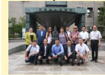
The participants in Japan