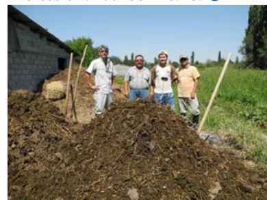
Pilot farmer and team of the project

At present, the Project, jointly with KNAU, is developing a manure spreader, making a comparative analysis of methane effluent, compost, and green manure. In addition, the Project plans around the end of September to construct compost facilities on the grounds of Professional School No.43. ●