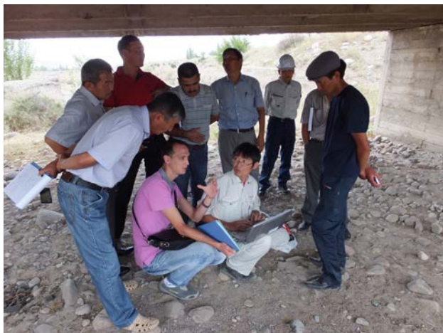
Master trainers started inspection of bridges & tunnels with the technical assistance of JICA experts