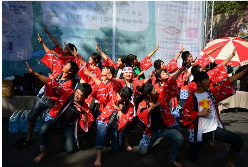
A Japanese tradition dance

This year JICA Kyrgyz Office also participated in the organization of the 2 nd Pedestrian paradise through its small contribution. Page 3