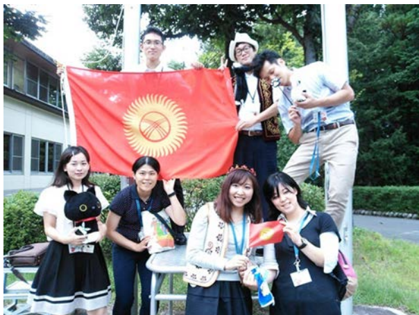
New JICA volunteers

On the 11th of October the 12th Kyrgyz Republic Volunteer General Assembly was held at Dostuk Hotel in Bishkek. The General Assembly takes place once a year. It is a great chance for Japanese volunteers working in KR to get together, exchange opinions, ideas, and impressions about Kyrgyzstan, its people, culture, work, etc. This time the volunteers could also listened to a lecture by a Japanese expert on the One village – one product project