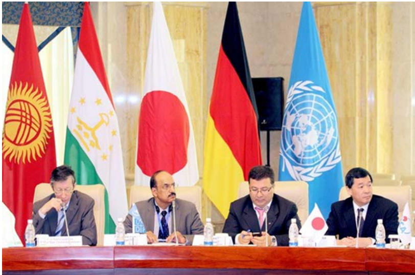
Regional ministerial conference

Starting from 2013 the plan of grant assistance through international organizations shifted from the the Japan Embassy in the Kyrgyz Republic to JICA.