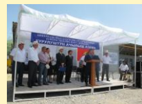
Official ceremony of event