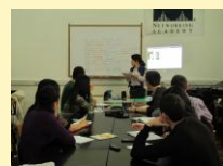
During the lecture