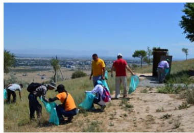
Eco action in Bishkek

attended the event. Each school had to prepare a 30 second advertisement about protecting natural environments. Afterwards the judge gives them their scores. The best advertisement will be broadcasted by the local TV station during the summer. As a result of this contest, 4 schools tied and are now competing against each other in a final game. I hope this contest and advertisement influences people to protect the natural environment. (Hanawa-san, JICA volunteer).