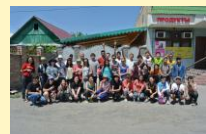
The participants in the Cholpon-Ata event