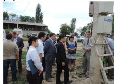
During a tour of the site

The ribbon-cutting ceremony followed the speeches to celebrate the opening of the site. After the ceremony the guests of the event went on a tour of the site where they were presented with demo field with planted vegetable crops, a solar greenhouse for growing seedlings, irrigation system of the demonstration field, and the compost making facility. At the end, the guests had a coffee break where they were able to share their views about what they saw during the tour and share experiences on the achievements of the project. ●