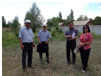
Accessing candidate site for greenhouse construction in Jan-Bulak Ayil Okmotu, Naryn raion

the project will produce a manual that will provide comprehensive information about all of the aspects and processes of solar greenhouse construction and vegetable production. ●