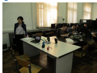
During the lecture