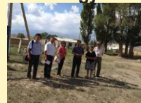
Accessing candidate site