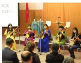
JICA volunteers komuz concert.