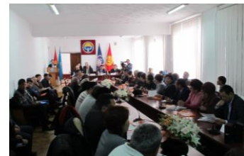
During the meeting in Naryn.

*The third phase of the OVOP project was started in 2017, during which the OVOP Issyk-Kul model was planned to be disseminated to other regions of the country. ●