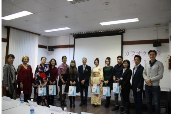
Participants and jury members.

On February 17 th 2018, KRJC conducted a Karaoke contest in Japanese. Students of Universities and schools in Bishkek interested in Japanese culture and language took part in the contest. Knowledge of Japanese was not mandatory, the only requirement being to sing a song in Japanese. Special guests of the contest included pupils of the Bilimkana-Kant-Luxemburg school and the secondary school named after I. Arabaev (Kochkor). The