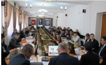
During the meeting in Osh.

In order to implement the “One Village One Product” (OVOP) approach in the regions of the country, on 9 th and 14 th of February 2018, a meeting of stakeholders regarding establishment of OVOP Platforms in the regions was held in the cities of Osh and Naryn. The stakeholders were representatives of the government authorities, business communities, various sectors and