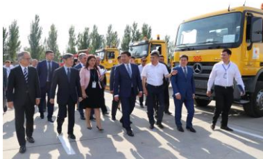
Review of the airfield equipment.

On June 29, under the grant project for improving the equipment of “Manas” airport, a ceremony of transfer of the air navigation system took place. The ceremony was attended by JICA President, Mr. Shinichi Kitaoka, who was in Kyrgyzstan on a two-day visit, and the Prime Minister of the KR, Mr. Muhammetkaly