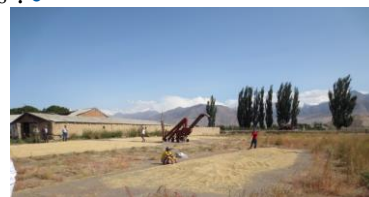
Kochkor district. Site, where TLC local type is planned to be constructed.

mentary representative of the Government of the Kyrgyz Republic in Naryn region: “Construction of the LTLC is very important for Naryn region, especially during the year of the region's development. Currently, farmers in Kochkor store their products in inappropriate conditions and have many losses. With the conditions that LTLC is has set, farmers could sell potatoes in spring at a better price and increase their income. I wish that this project is implemented successfully and becomes an example, a model for other agricultural cooperatives”. Murashev Nurbek, Minister of Agriculture, Food Industry and Melioration of the KR expressed support for the project and noted the importance of TLC creation in the KR: “Establishment of trade-logistics centers, warehouses for vegetables with the application of the world's best modern practices and technology in line with international standards could solve most of the problems in promoting agricultural products on internal and international markets”.