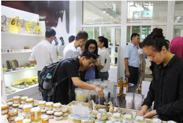
OVOP regional shop, at Osh City, 1 Bayalinov Street (In Osh Nuru Hotel).

The first regional OVOP Shop (“Nomad Store”) was opened in Osh. The Opening Ceremony took place on July 3, 2018, in Osh city, where representatives of local authorities, OVOP Committee members of Osh oblast, representatives of donor organizations, producers and other related parties were invited. The guests were introduced to the goods produced within the frame-