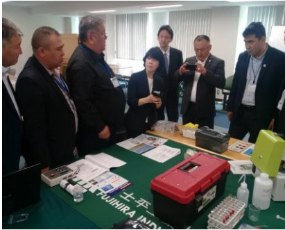
Visit to the Fujihira company that produces the mini kits/equipment for livestock husbandry.

A training on the "Improvement of Technologies and Systems of Veterinary and Animal Husbandry for the Production and Distribution of Raw Milk" organized by the JICA project for Market-Oriented Milk Production in Chui Province (MOMP) was held in Japan. 11 representatives of the dairy sector from Kyrgyzstan took part in the training. Participants were familiarized with Japan's experience in developing and managing of the dairy sector as well as dairy cow husbandry, feeding and milking