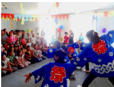
Fisherman dance - “Sooran Bushi”.

Festivals of Japanese culture are already well known and loved by children. They look forward to these events which take them on a journey to the culture of the Land of the Rising Sun. So, on the 19 th of May 2018, a festival supported by JICA volunteers was held in one of the schools in the Ak-Suu