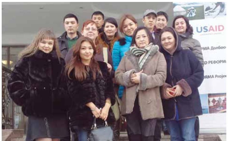
Participants of the training on Public Administration in Tourism and Process-Based Management under ISO standards.

Despite capacity shortcomings, the Tourism Department continues to be an open and committed partner of REFORMA that is striving to play a stronger