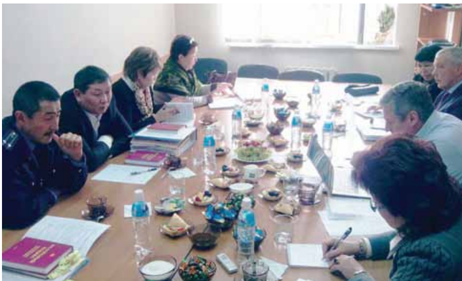
Discussion of issues of VAT administration with the representatives of STS regional offices.

The REFORMA team is working with tax authorities to determine how to put these changes into effect within 2014. REFORMA is sponsoring a study tour for STS and Ministry of Economy officials to Kazakhstan and Belarus to learn about VAT administrative requirements under the Customs Union. The group will also observe an automated VAT invoicing system, which the Kazakh tax service will soon introduce.