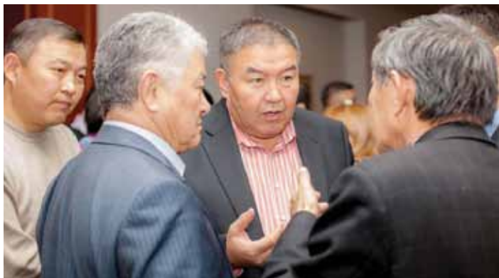
Stakeholders discuss Strategy recommendations.

Over the next few months, the Ministry will circulate the Strategy and Action Plan among Ministries and Agencies before presenting it for adoption to the Government. At the same time, the Ministry, with REFORMA's assistance, will conduct additional round tables and opportunities for discussing recommended policies to stakeholders throughout the country.