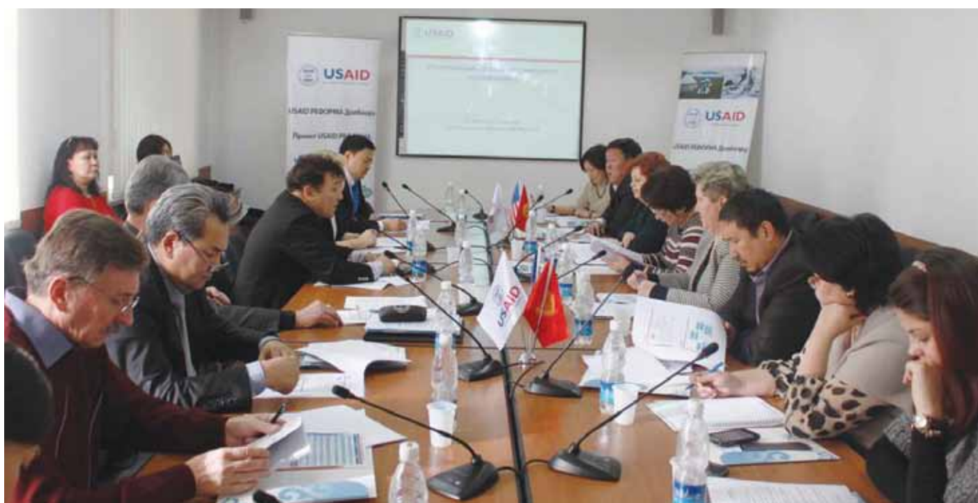
Ministry of Economy hosts round-table on self-regulation with business associations.

Consequently, REFORMA has identified three possible ways to move the project forward, including forming a public-private working group for further discussion and action, proposing and drafting amendments to existing sectoral laws, or drafting a framework law. A fourth alternative is to provide no further assistance. REFORMA is currently discussing these options with the Ministry.