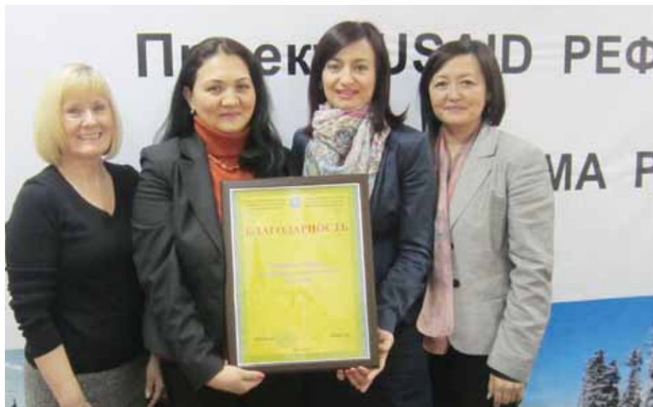
REFORMA received a certificate of appreciation from the Ministry of Culture, Information and Tourism for HICD assistance to the Tourism Department.

The meeting coincided with the launch of the implementation phase of the HICD program, which includes the optimization