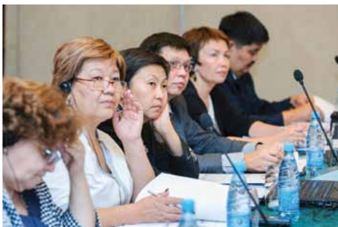
Public and private fiscal and tax specialists participate in a fiscal modeling exercise to identify the tradeoffs of various tax regimes.