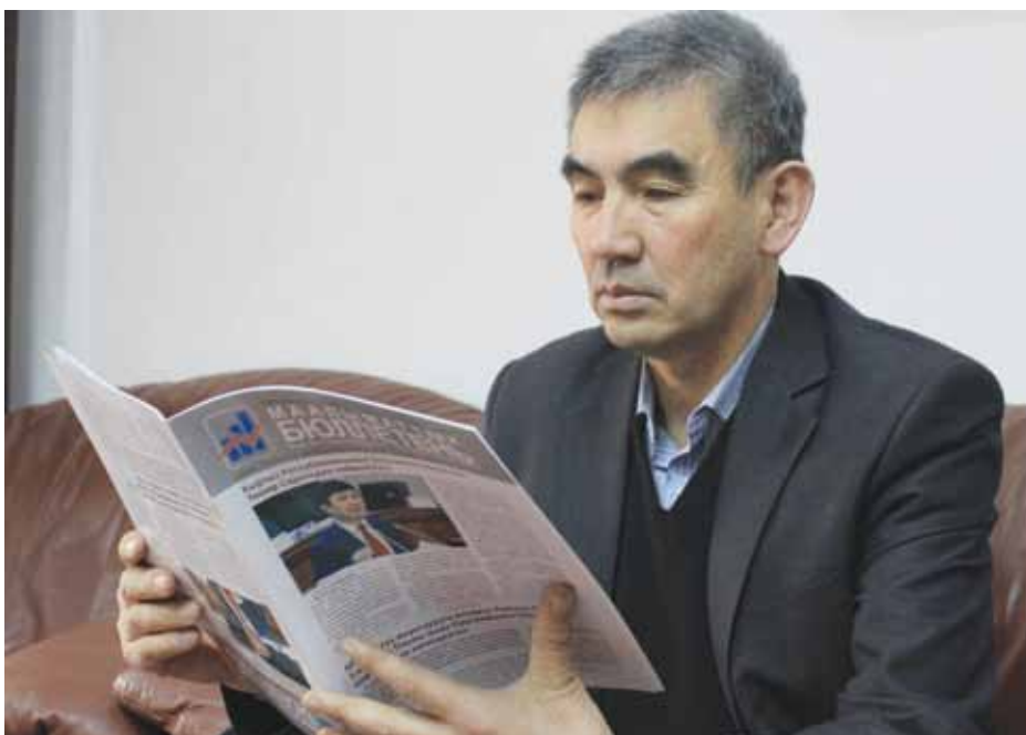
MoE Information Bulletin will be one of the sources of information for the public and the business community on the Ministry's current activities and future plans.

The selected implementing partner will also support the newly created Internal Development Unit to implement systems for ongoing internal strategic planning, developing and monitoring the Ministry's performance, and improving human resource management. The firm will work with the State Secretary to create a Human Resource Development Strategy and Action Plan and provide assistance in initial implementation.