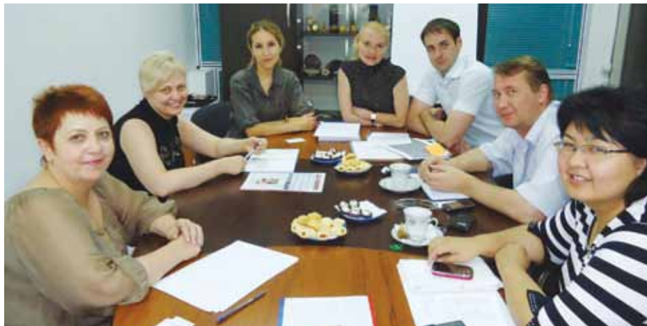
EcoPartner team discusses amendments to legislation and regulations governing ecological and technical safety inspections.

scribed methodology for conducting environmental and technical safety inspections, REFORMA will support the development of this methodology and that for taking samples for compliance testing. REFORMA will also sponsor a series of training courses for inspectors on the introduction of changes to the legal and regulatory regime and provide training to businesses to ensure they are aware of their rights throughout the inspections process.