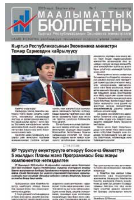
A snapshot of the cover page of the MoE News Bulletin.