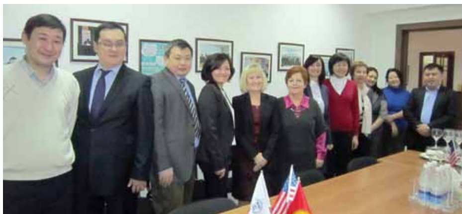
Union of Entrepreneurs and REFORMA staff launch project to draft implementing regulations to the Licensing Law.

With the adoption of the Law 'On the Licensing and Permitting System of the Kyrgyz Republic' in October, REFORMA has agreed to assist the Ministry of Economy in drafting regulations, which is the next step in ensuring implementation of the Law. In December, REFORMA awarded a contract to the Union of Entrepreneurs following selection through a competitive tender. The Union began its work in earnest in January to write draft by-laws on: (1) licensing of certain activities; (2) the methodology for risk assessment; (3) the procedures for licensing control; (4) the procedures for keeping a register of licenses and permits. The Union will work with REFORMA to conduct a series