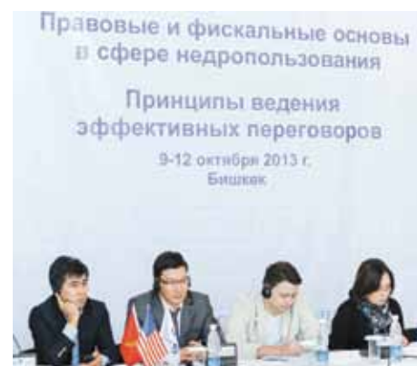
Department Heads and other Government officials participate in mining policy training by the Vale Columbia Center.